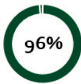
Working In BPI Related Field