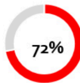
BPI "Extremely Valuable" To Their Business